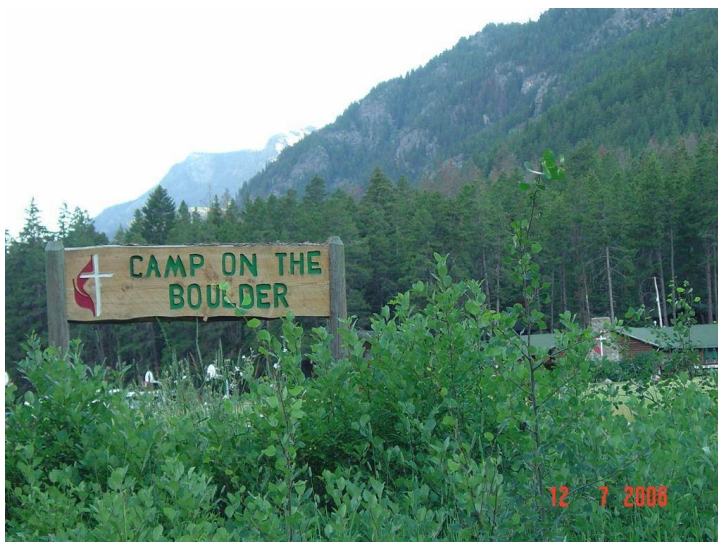
Camp on the Boulder, McLeod MT