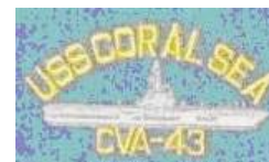
Ship's Logo CVB, CVA, CV

Credit Card Number _____ Exp. Date _____