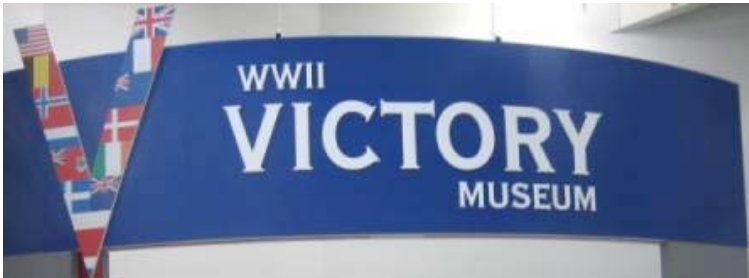
Entrance—to The Victory Museum in Fort Wayne!

still young the sea stories began and continued to all hours of the night.