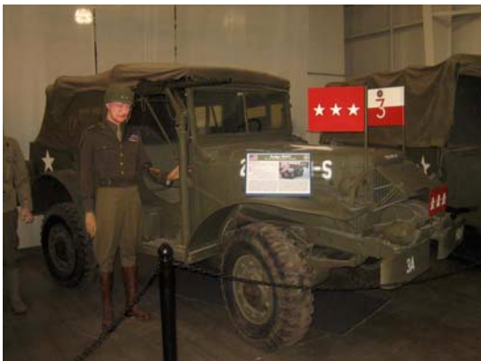
Patton's Command Car—displayed in the museum.

Saturday was a full day of sea stories. The ladies continued their trips to favorite places on Saturday that began on Friday.