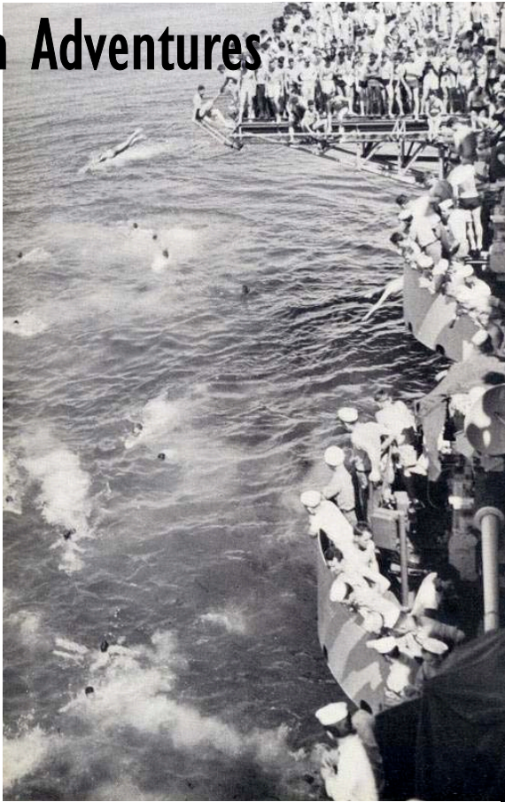
1954 "Swim Call" in the Med.

Once in a much greater while a Beach Party might be scheduled. I recall only one. When the participants returned they talked about the 3.2 beer. I remember the beer being stored below the