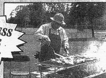
BBQ's, Picnics, Theme Parties

We Invite You To Visit Our Showroom & Commissary In Westland