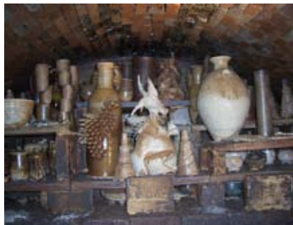
Tozan kiln opening.

engineers insisted that a one million B.T.U. after-burner be positioned at right angles in the flue half way up the hillside. I was part of the firing that had to be aborted when the melted flue bricks began flowing down towards the chambers!