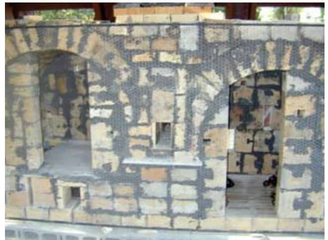
Building the Ombu kiln with used bricks from a cement factory.