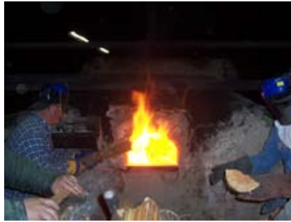
Nanaimo Tozan firing.

As you can see from the picture (below), pollution from the kiln became an increasing issue with the new highway directly above and encroaching housing development. At one point, environmental