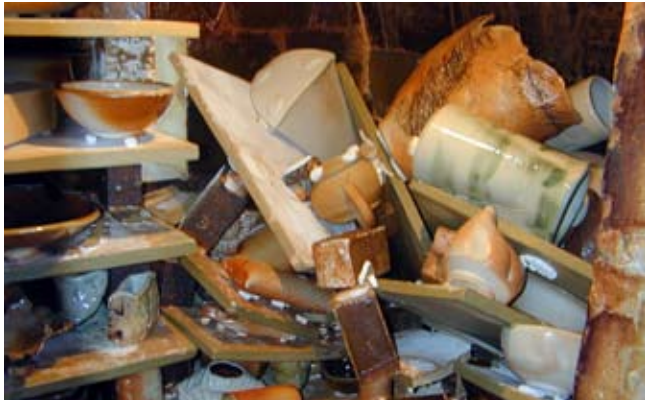
Melted alumina shelves in the Ombu kiln.