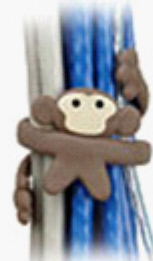
Monkey wire holde

This is a pic list of what I have chosen to be the best gadgets for December. Check out the website http://www.thinkgeek.com/gadgets/