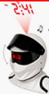
Top Gear pro-jected alarm clock