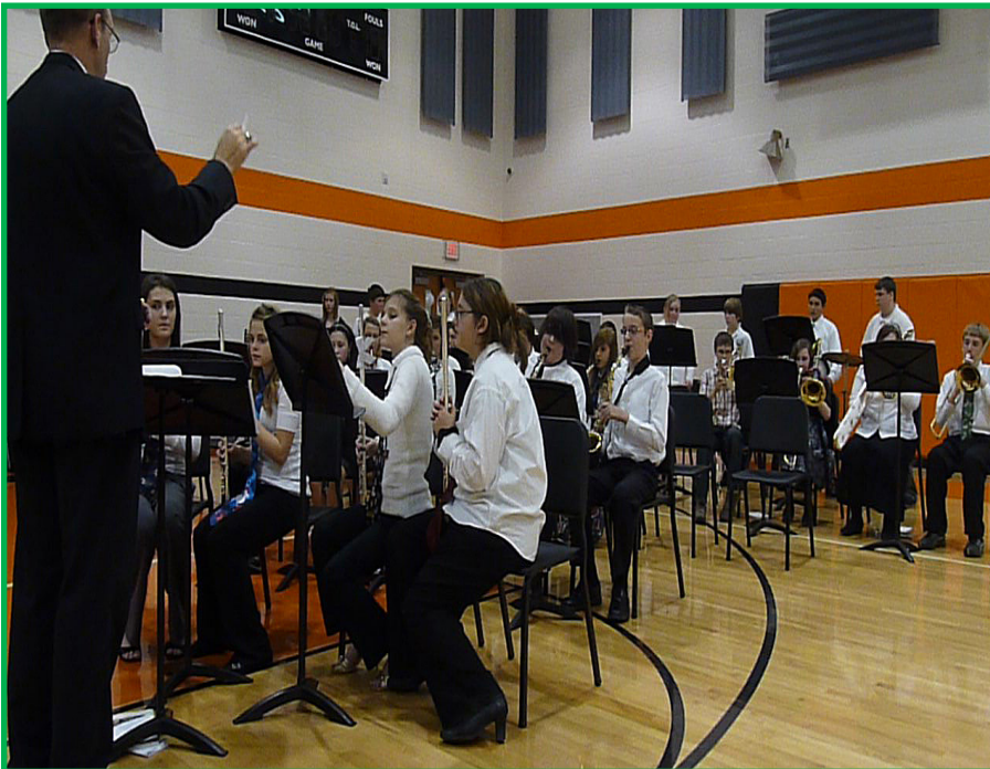
7th & 8th grade Band performing at the Concert on 12/16.