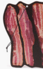
Bacon Air Fresh-ener