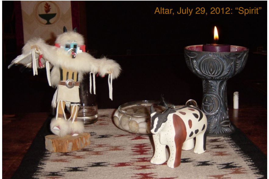
Altar, July 29, 2012: "Spirit"

Our year continues with a reminder that our theologies are not handed to us like creeds. They come from our unique journeys and are highly personal. But build them we must if we are to design a significant presence in the world for the religion we now share. Our theologies must drive our commitment to the Unitarian Universalist Religion, and our religion must compel us to the creation of a welcoming and justice-seeking Beloved Community. We are the Architects of our Faith and our future.