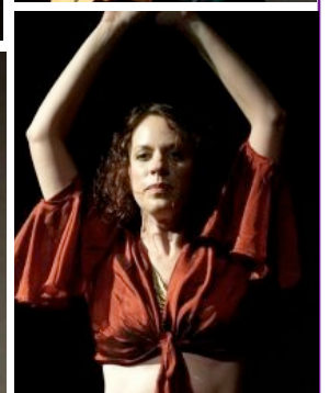
from Vaudeville Night 2011