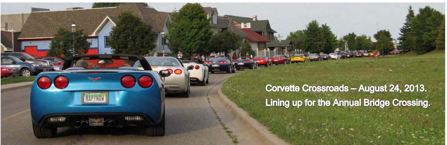
Corvette Crossroads – August 24, 2013. Lining up for the Annual Bridge Crossing.