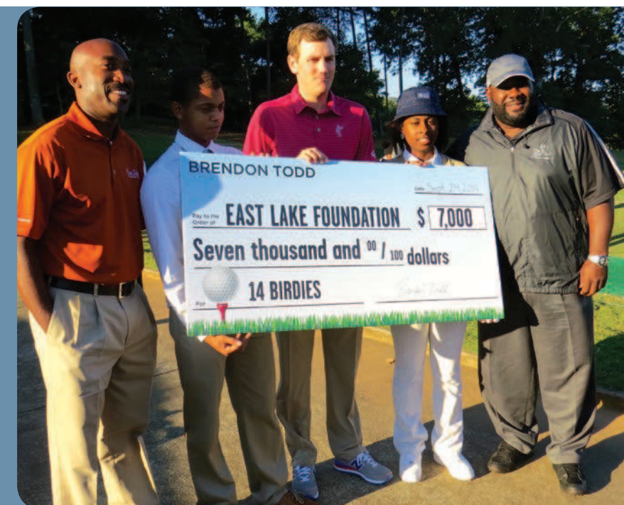
Brendon Todd presents $7,000 check to the East Lake Foundation to benefit The First Tee of East Lake.

During the TOUR Championship by Coca-Cola, PGA TOUR golfer Brendon Todd toured the new Drew Charter School Junior and Senior Academy at the Charlie Yates Campus. Inspired by the facility and the students he met, he made a pledge to donate $500 to the East Lake Foundation for each birdie made during tournament week. He finished with 14 birdies for the week, including an impressive seven in Sunday's final round at East Lake Golf Club. Ultimately, he donated $7,000 and golf equipment to support the mission and work of the foundation. ■