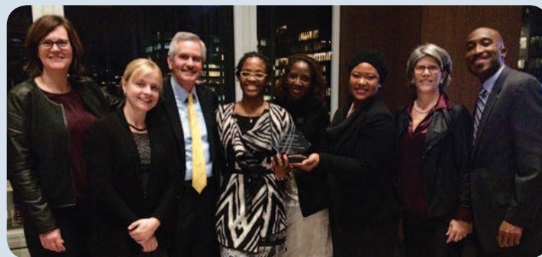
East Lake Initiative representatives accept the Mutual of America Award in New York City