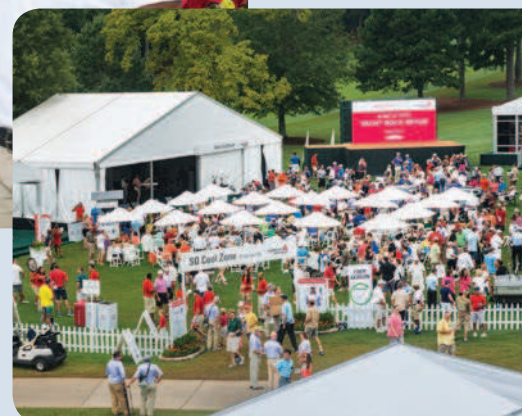
Patrons enjoy the Yacht Rock Revue Concert at the Southern Company's "SO Cool Zone."