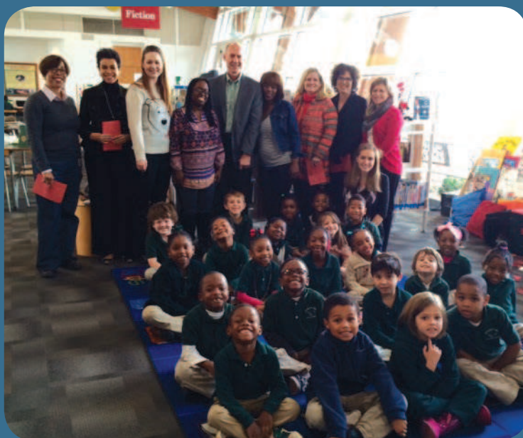
Coca-Cola volunteers with Drew Charter School students

Want to get involved with Drew Charter School? Become a volunteer! By sharing both personal and professional skills, volunteers expose students to real-life experiences bridging the gap between the importance of education and building a better future. From read alouds and special events in the Elementary Academy, to tutoring and mentoring in the Junior and Senior Academy, we have the opportunity for you or your organization. ■