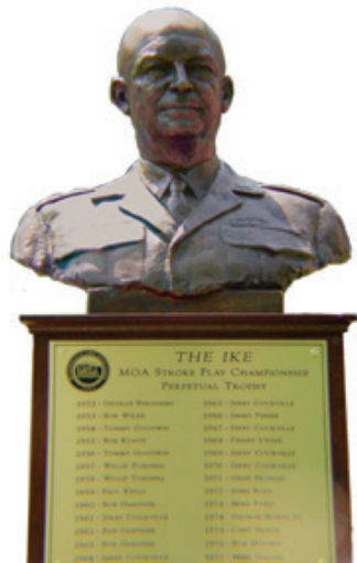
The Ike Championship boasts one of the MGA's most coveted trophies.