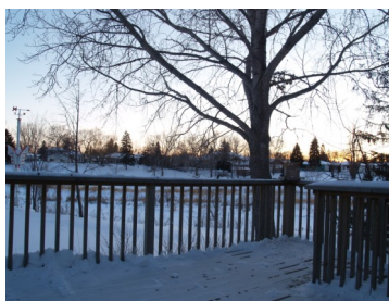
The back deck

"My 11 day stay felt like a home away from home. The professionalism and efficiency with which the residence is run provides friendly and personal care for all who experience respite in this home-like environment."