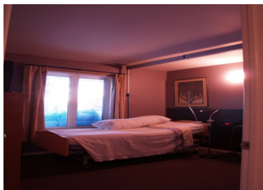
One of the private bedrooms