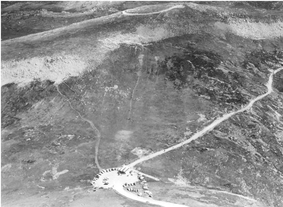
Rawsons Pass and the Mt Kosciusko summit as it was (from the air) in the 1970s