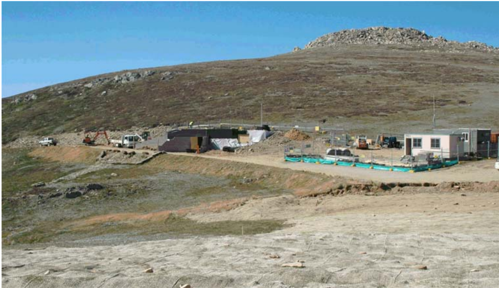
Restoration and toilet works this summer at Rawsons Pass.