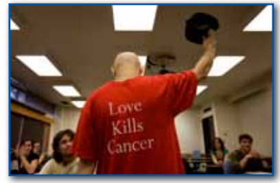
"Not As I Pictured"

nationwide. His program contains images from "Not as I Pictured". More information can be found at www.notasipictured.org.