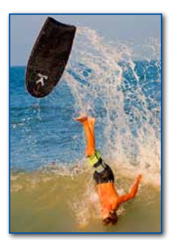
"Oct 2012 Open #4" by DON PIVONKA Salon Open High Score