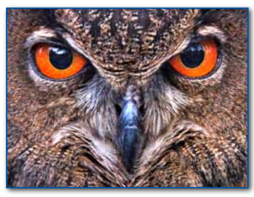
"Great Horned Owl" by DEE LANGEVIN