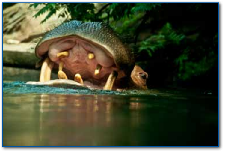
"Message to Self!" by DICK GREENWOOD

Trendingschmending! Good gear is nice to have, but chasing "goodest" the shouldn't be confused with chasing the most "fanciest and newest." If your image is out of focus, poorly