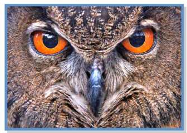
Great Horned Owl, 2012 DVCCC Medal (Color Projected Image), Dee Langevin, USA

It's time to enter Delaware Photographic Society's annual competition. WIEP is one of the oldest and largest juried photographic exhibitions in the USA. It is PSA recognized and attracts photographers from all over the world.