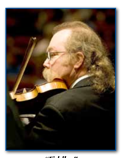
"Fiddler" by CEZAR SZAFRANSKI Class B Assigned High Score