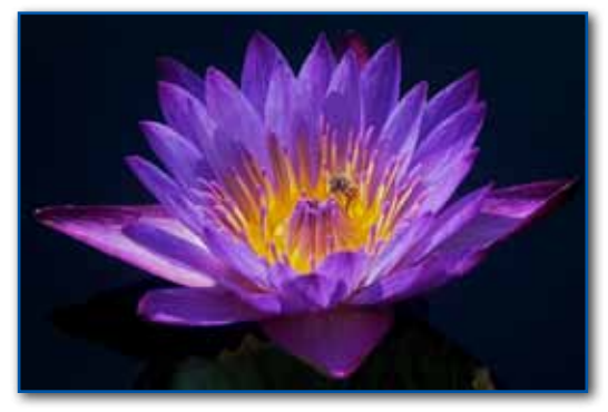
"Water Lily 1" by FRED ROSENBERG Class A Open High Score