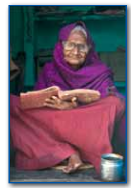
"Old Lady Reading"

Dinner with Speaker is at 6pm in the Cokesbury main dining room. Advance reservations are required, and the cost is $18.25 per person. To RSVP, contact Eileen Furlong at 302.764.6922 or efurlong@comcast.net.