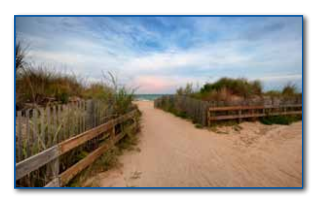
"30th Street Dunes" by LARRY HINSON Class B Open High Score