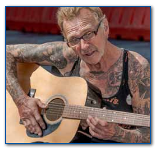
"On Powell Street" by ED FORD Class A Assigned High Score