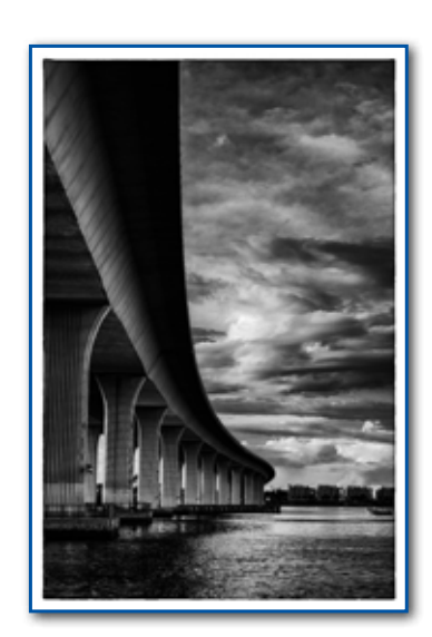
"Bridge Over St. Lucie River" by JC ROY Salon Open High Score