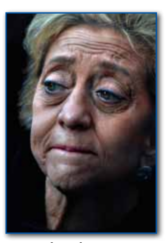
"The Observer" by HELEN GERSTEIN Salon Assigned High Score