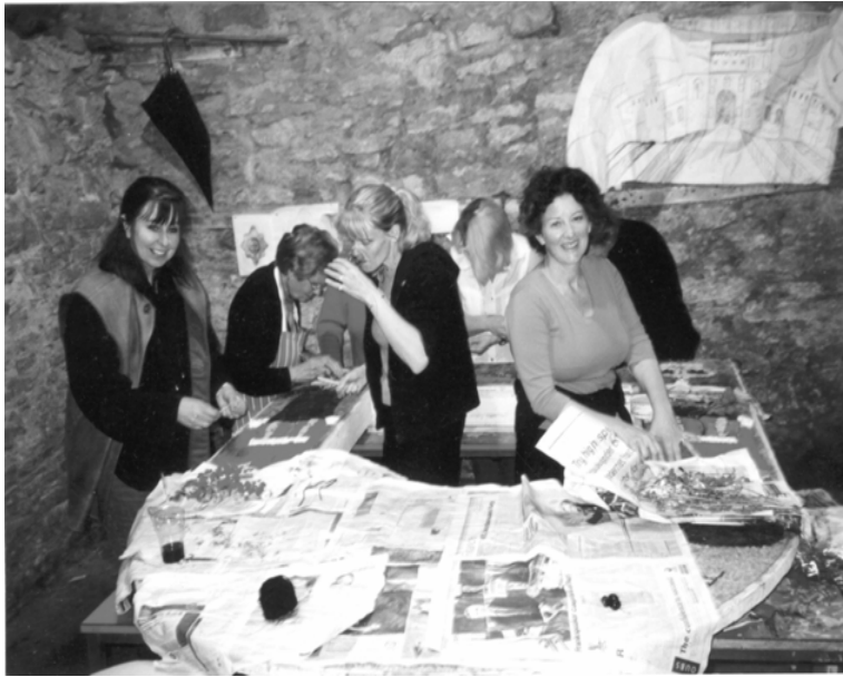
It's not all work around the boards at Middleton . . .

Dressing the clayed boards begins on Monday 19 May , but the work doesn't start and end at that. A week earlier, Saturday 10 May , the boards need to be put in the river to soak, coming back into the playground a week later for the messy job of claying. There are notices that need placing at the major road junctions leading to the village