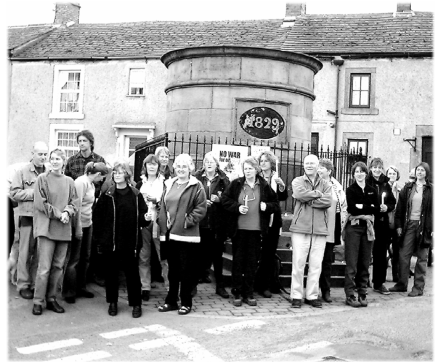
Village opponents of the war in Iraq making their point with a candlelit vigil in Fountain Square.

Middleton Well Dressing and Village Market