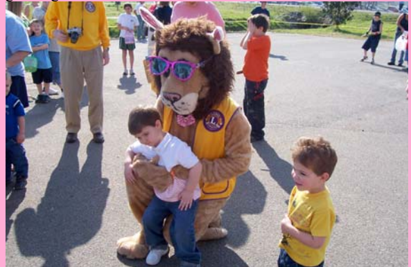
Jasper Lions ready to "hop to it" when the Egg Hunt begins!

The Jasper Club hosted their 4 th Annual Easter Egg Hunt on Saturday, March 26. There were over 500 children on hand to find over 15,000 eggs – the hunt was over in about 15 minutes! Pictured here is their mascot, Dan D. Lion , greeting some of the children.