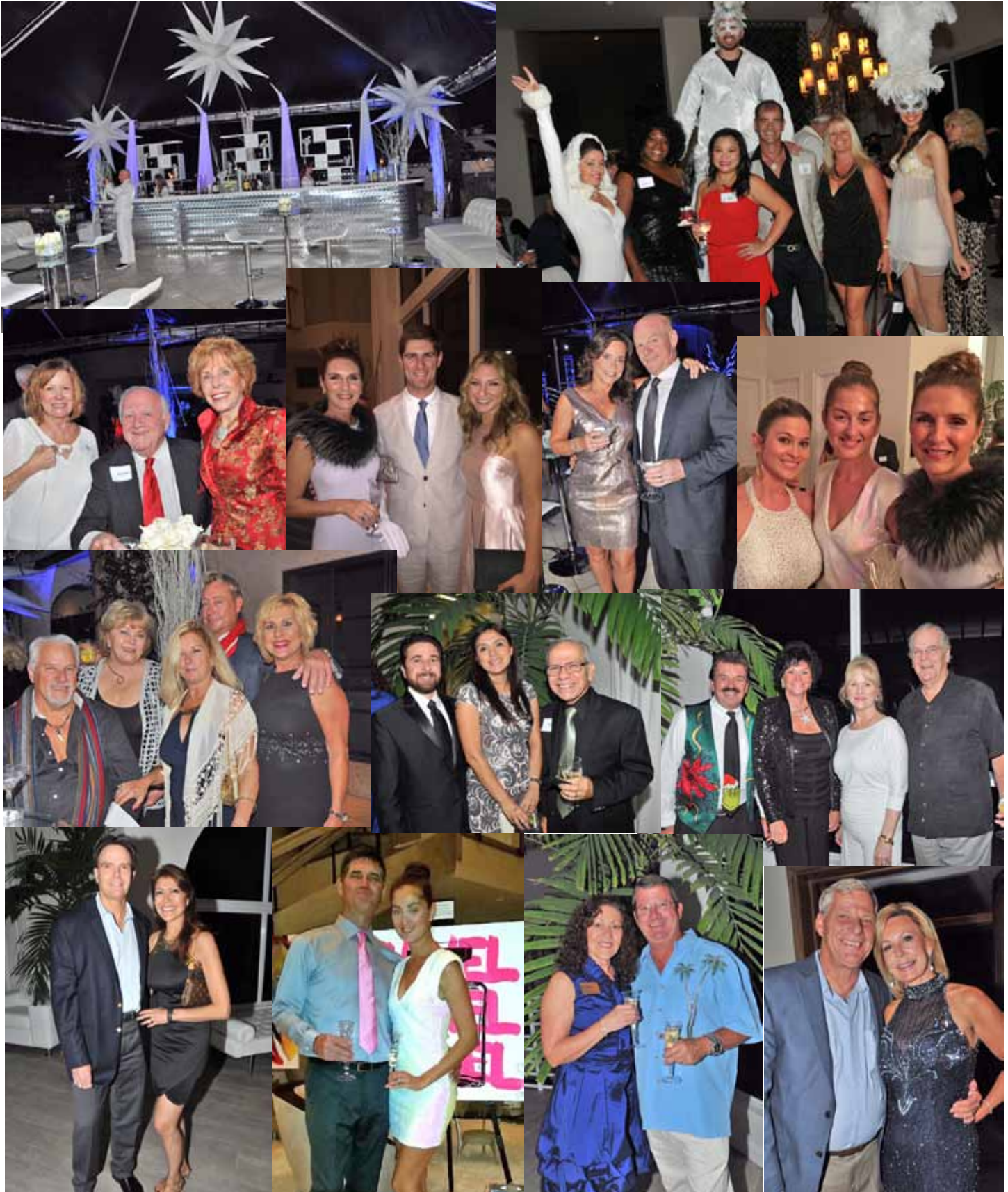
Special thanks to Ginny Fujino at Black Tie South Florida for her great photos.