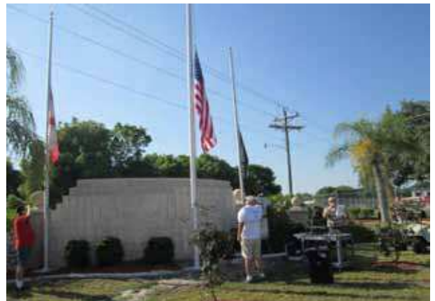
All salute our American Flag at half-mast.