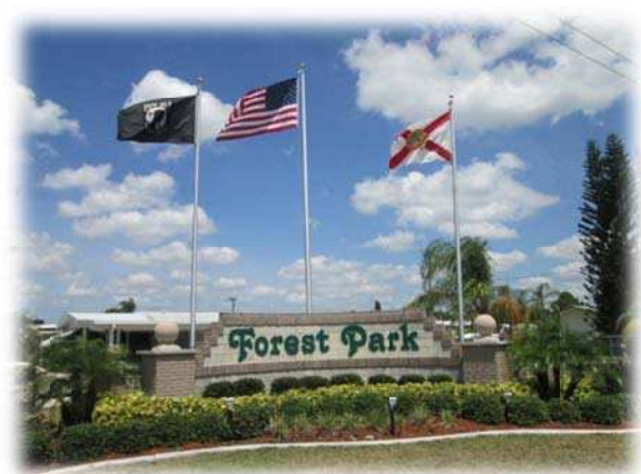
The POW, American Flag and State of Florida flag flying high and proud as Memorial Day 2014 ends.