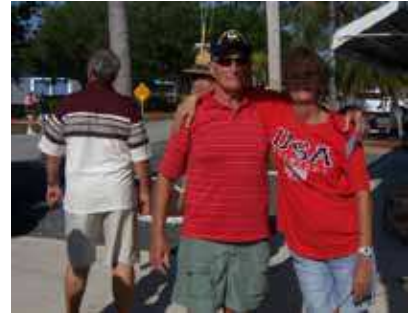
They came by golf carts, bicycles and on foot.