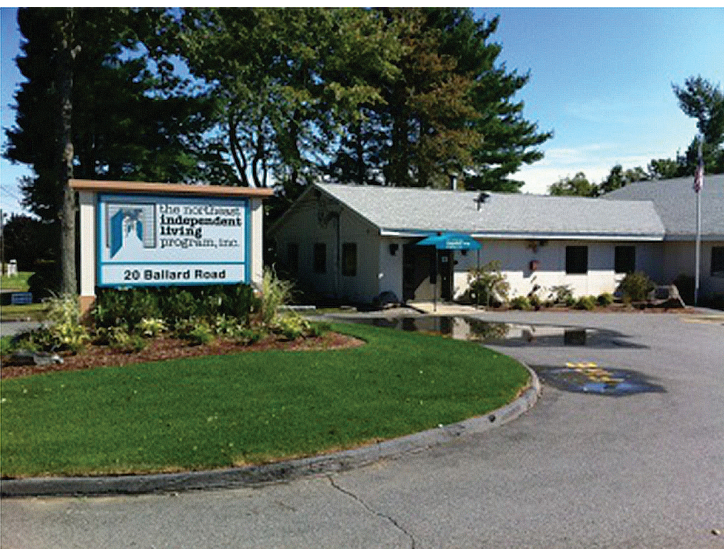
NILP's home in Lawrence, MA