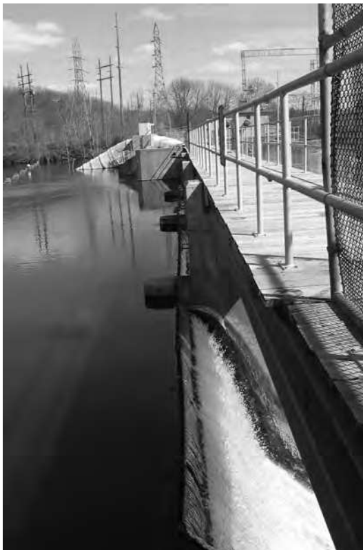
The Huron River has nearly 100 known dams.