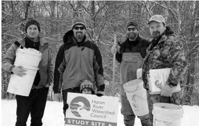
We need you to help us study water quality.

HRWC is expanding monitoring this season to lower Huron sites in eastern Washtenaw and western Wayne counties, as well as sites in the Ecorse Creek and Combined Downriver watersheds. This expansion builds on the success of the Water Quality Monitoring Program, which has generated highly useful water chemistry data for streams in the middle Huron and Chain of Lakes watersheds.