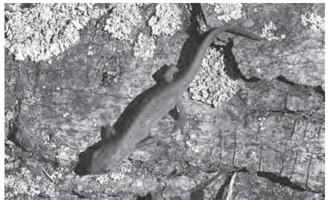
The red spotted newt transforms from tadpole, to a terrestrial eft (pictured here), then back to an pond-dwelling adult.