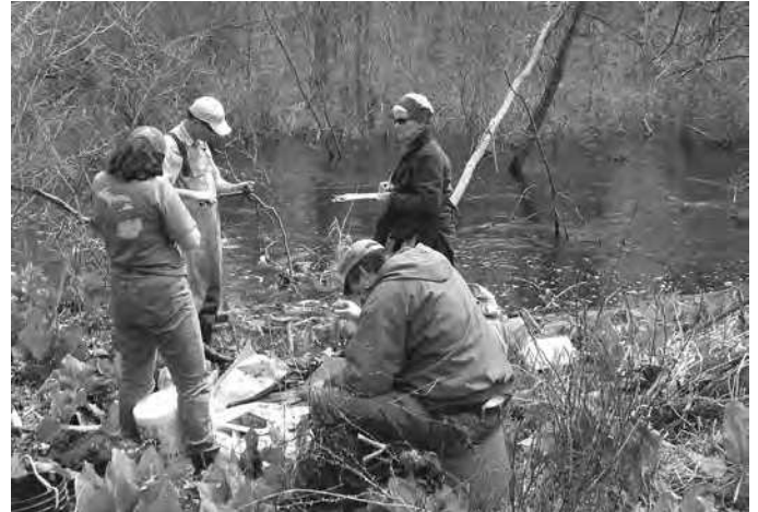
Spring is a great time to watch the creek flow - this team is sampling a quiet location on Davis Creek.

Some types of bugs are also very useful in checking on the water quality of a stream - that is, whether or not the