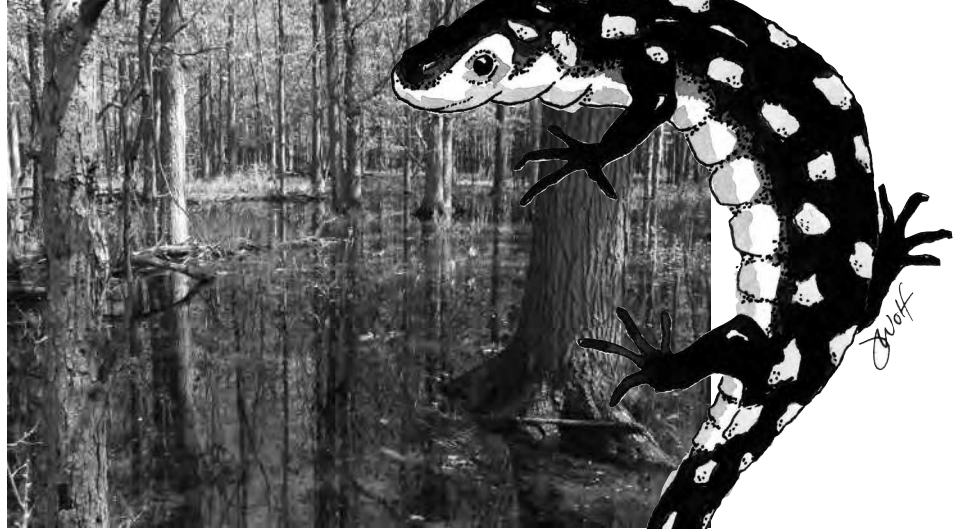
Wooded swamps with native species of hardwoods are great habitat for salamanders, including the spotted varieties.