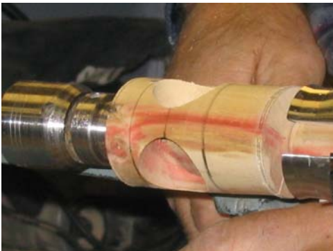
The globe cylinder with 3 “windows” drilled into the sides ready to begin shaping the globe.

At the November member meeting we were presented a great project by Erwin Nistler. A globe style ornament that was not hollowed but had open sides “Windows” into the interior of the ornament allowing a tiny figure to be hung and viewed on the inside. Erwin starts this project by turning a cylinder and then drills 3 evenly spaced holes around the perimeter. Erwin wraps a piece of masking tape around the cylinder