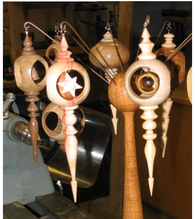
Some samples of Erwin's Ornaments, notice the “windows” in the globe and the hanging miniature ornament.

ment to hang on the inside to be viewed through the open “windows”. With the mini ornament being so small, that is probably the hardest part of the hole ornament but the small details really make the difference.