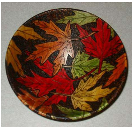
One of Andi's finished pieces, check out the website to see the beautiful colors and details!

can find the time. She creates artistic pieces that are in very high demand. She copies leaves, vines and other natural plant parts to create her unusual pieces. She has devel-