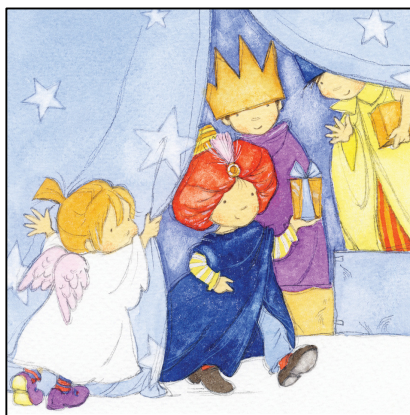
Card B - Three Kings