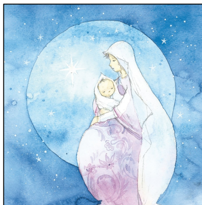
Card E - Starry Night