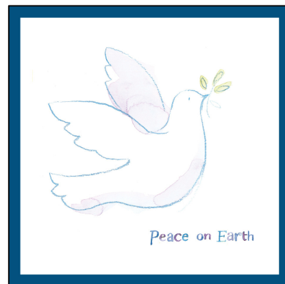
Card C - Dove of Peace