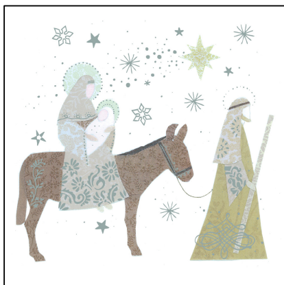
Card A - Journey to Egypt