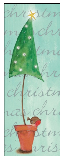
Card F - Tree and Robin

The greeting inside the cards reads Season's Greetings