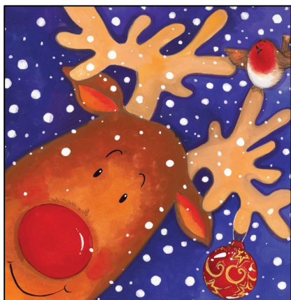
Card D - Reindeer