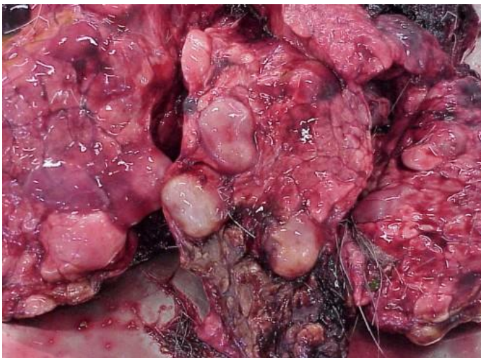
Hydatid cysts infect lungs, liver, and other internal organs of big game animals.