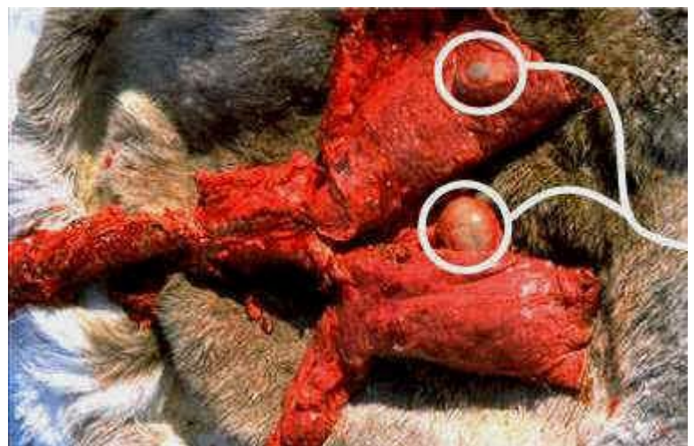
Hydatid cysts infecting moose or caribou lungs.

My first Outdoorsman article on hydatid disease caused by the tiny Echinococcus granulosus tapeworm was published nearly 40 years ago. Back then we had many readers in Alaska and northern Canada where the cysts were present in moose and caribou and my article included statistics on the number of reported human deaths from these cysts over a 50-year period, and the decline in deaths once outdoorsmen learned what precautions were necessary to prevent humans from being infected.