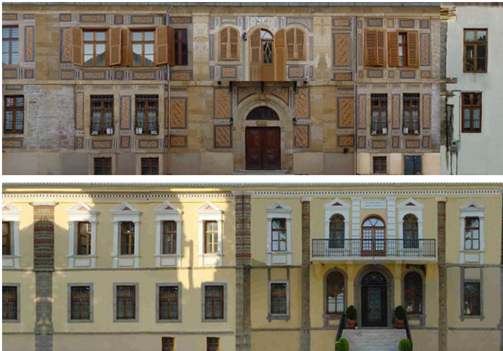
Fig. 2. Processed texture images.

The VRML 3D model can be easily accessed from different Internet browsers using a VRML client plug-in. Even nowadays where broadband connections are becoming a standard for the average home user; there is always a need of