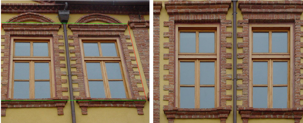
Fig. 1. Perspective correction.

(vertices) into triangles or quads. Thus, it is possible to restore the basic geometry of the facades of the buildings (Fig. 3).