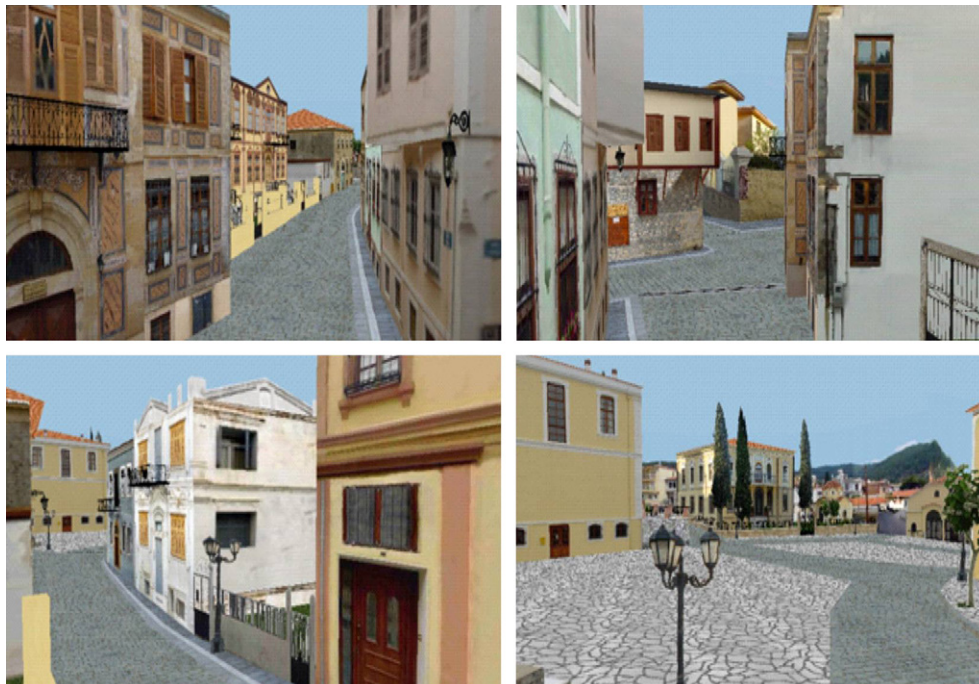
Fig. 5. Screenshots from the 3D reconstruction and the website.

The fidelity and accuracy of the final 3D model is by far inferior to any other 3D models that could have been created by geodetic measuring techniques or terrestrial 3D laser range