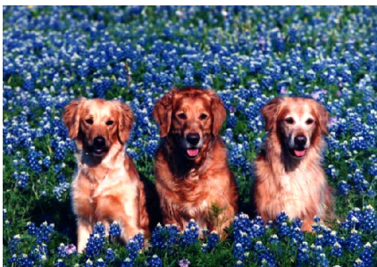
Morgana 9/24/94-11/2008 Hunter 8/8/1990-2/2005 Amber 7/24/1988-5/2002