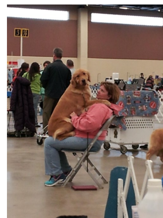
After the show