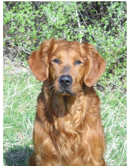
LaCrosse Adirondac Co-Pilot***WCX, Nov 1,2005-Oct 22,2013 Anna Curry