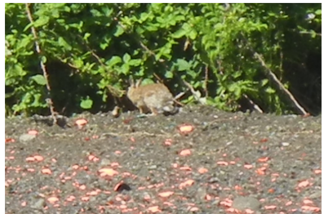
Cruisier and the rabbits showed up to help out as well.