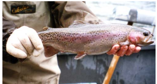
REDSIDE FROM CROOKED RIVER ELECTROSHOCK SURVEY

Everyone pays for their own breakfast, and no reservations are required. Don't forget to buy a new 2004 fishing license (one of the benefits of this outing is that you won't forget to buy one in April!). Yes, you can bring the in-laws if you want to. See you at Jake's.