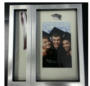
Your Schools Diploma Plaque