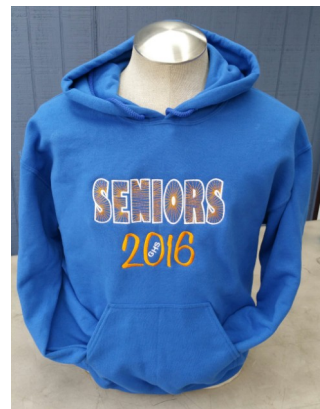
Tax is already included on all prices