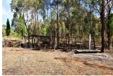
Image 57: The remains of a timber work shed. Facing northwest. File-7054.