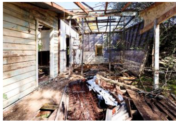
Image 21: Former room that was once a part of the weatherboard cottage. Facing northwest. File-7012.