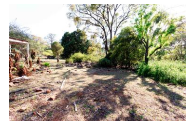
Image 49: Homestead garden to the southeast. Facing northeast. File-7007.