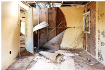
Image 23: Interior of the fibro/Masonite addition (southwest rooms). Facing northeast. File-7041.