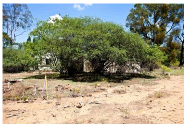
Image 47: Homestead garden from the driveway. Facing southwest. File-6863.