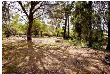
Image 63: Looking through the garden south-east of the homestead. Facing east. File-7069.