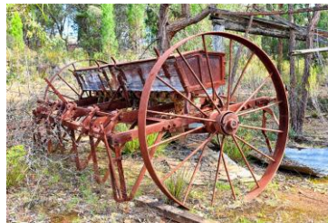
Image 60: Remains of a seeder left beside a former shed. Facing north. File-7058.