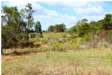
Image 62: View over the landscape south of the homestead. Facing south. File-7062.