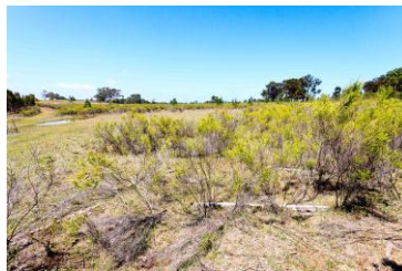
Image 36: View to the dam and paddock. Facing northwest. File-6805.