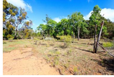
Image 54: Boundary posts from the tennis court (right), northeast of the homestead. Facing northwest. File-7024.