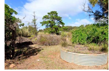
Image 55: View out from the fibro / Masonite addition. Facing southwest. File-7031.