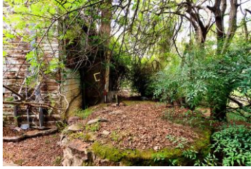
Image 56: A well is located in the garden behind the original weatherboard cottage. Facing southeast. File-7035.