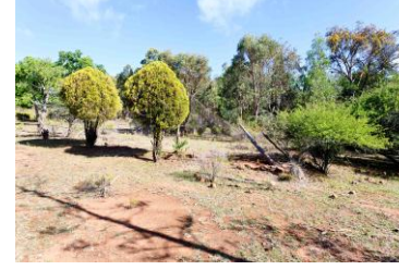
Image 53: The tennis court and entrance driveway. Facing north. File-7021.