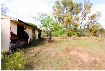
Image 13: Wider view along the frontage of the fibro/masonite addition. Facing southwest. File-7029.