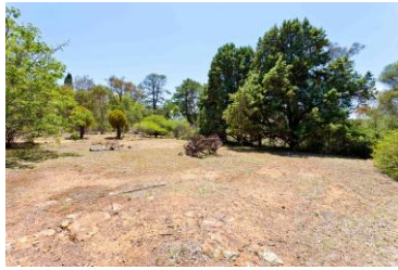
Image 45: Turning area in front of the homestead. Facing northeast. File-6821.