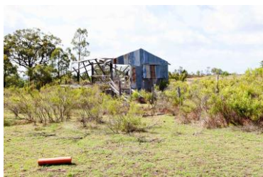
Image 41: View to shearing shed across yards. Facing east. File-7065.