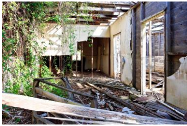
Image 20: Interior of the fibro addition. Facing southwest. File-7010.