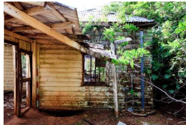
Image 17: Rear of the weatherboard cottage and side extension. Facing southeast. File-7032.