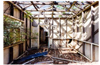
Image 22: Interior of the fibro addition. Facing southwest. File-7018.