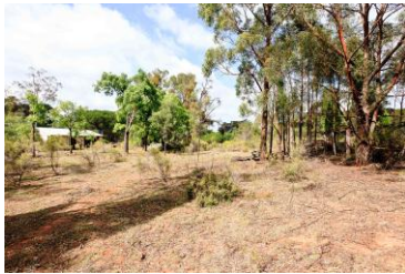
Image 59: General view back to the homestead from the remnant shed with seeder. Facing south. File-7057.