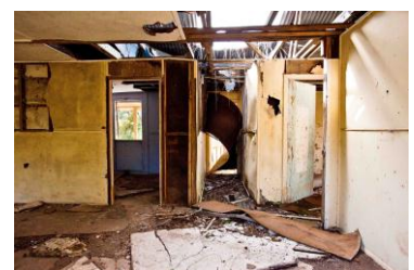
Image 28: Interior of the fibro/Masonite addition (main area). Facing southeast. File-7050.