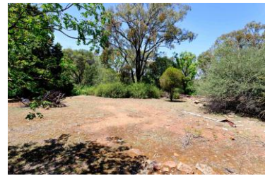
Image 46: Turning area in front of the homestead. Facing east. File-6852.