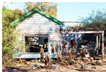
Image 8: East elevation of the original weatherboard cottage. Facing northwest. File-7004.