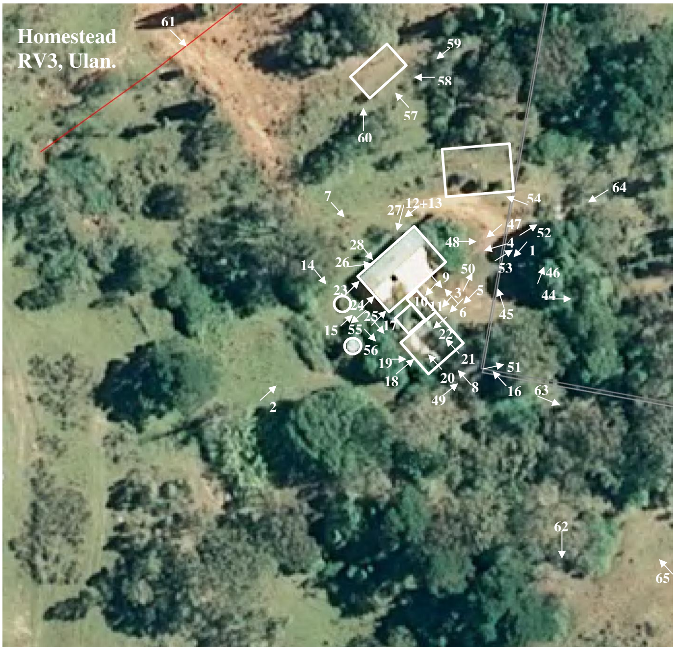
Figure 7.1. Image showing the positions from where photographs were taken of the Homestead RV3.