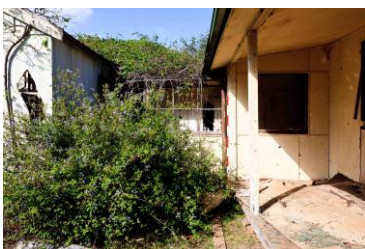
Image 10: Area between the fibro cottage and the fibro/masonite addition. Facing southwest. File-7017.