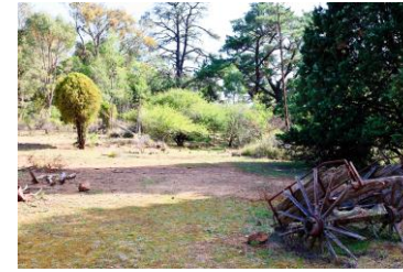
Image 50: View from the homestead to the driveway. Facing northeast. File-7013.