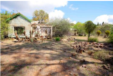
Image 16: Former frontage of the weatherboard cottage. Facing northwest. File-7110.