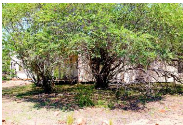
Image 4: Shade trees beside the verandah of the fibro/masonite addition. Facing west. File-6868.