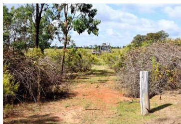
Image 39: Driveway continues to the shearing shed from the house. Facing southwest. File-7063.