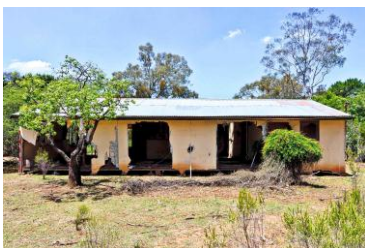
Image 7: West elevation of the fibro/masonite addition. Facing southeast. File-6875.