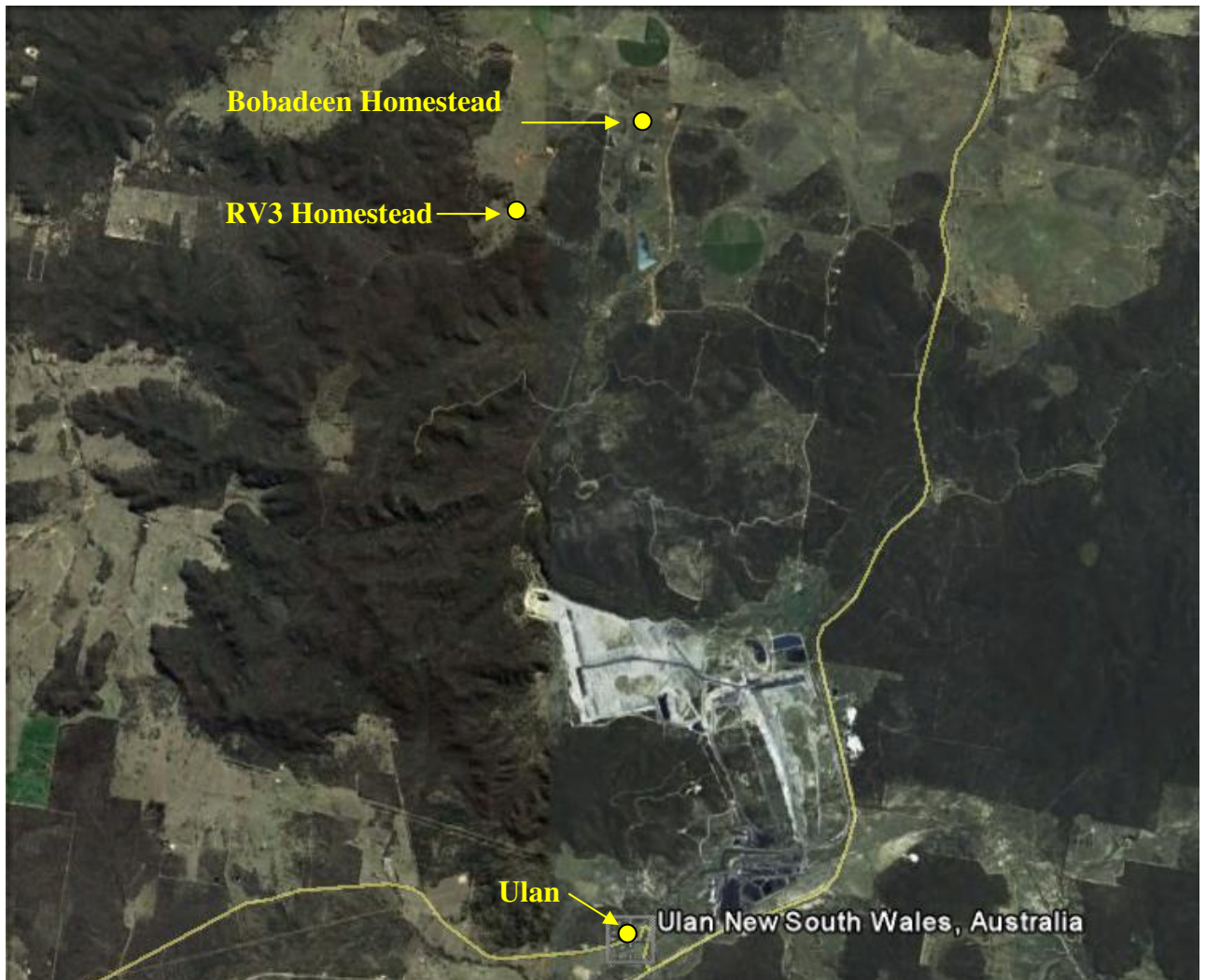
Satellite image showing the location of Homestead RV3, Bobadeen Homestead and Ulan.