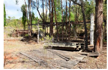
Image 58: Timber cladding and flooring from the shed lie on the ground. Facing west. File-7055.