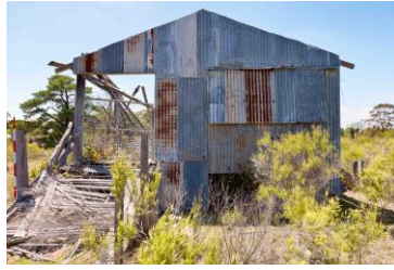
Image 30: The only standing iron clad elevation. Facing east. File-6797.