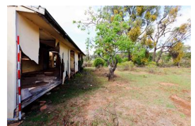
Image 12: View along the frontage of the fibro/masonite addition. Facing southwest. File-7028.