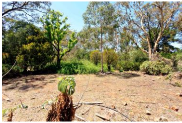
Image 44: Homestead garden to the southeast. Facing southeast. File-6819.