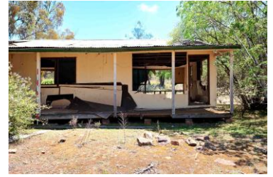
Image 3: The more recent fibro and masonite addition to the northwest. Facing northwest. File-6847.