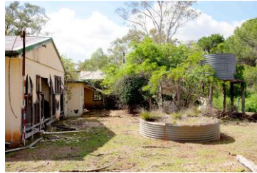
Image 14: View along southwest side of the homestead with tanks and well. Facing southeast. File-7083.