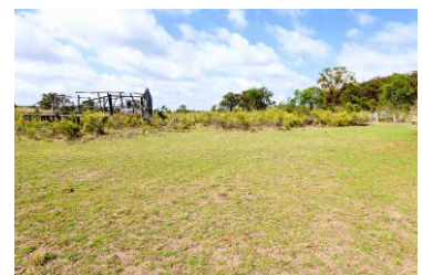
Image 40: View of shearing shed in the landscape. Facing southwest. File-7064.