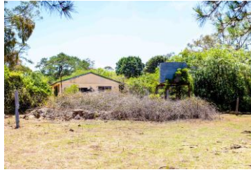
Image 2: View across to the raised water tank, stone wall and fibro addition. Facing northeast. File-6812.