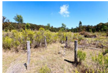
Image 33: Race leading between the yards and shed. Facing west. File-6792.