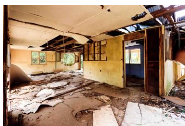
Image 26: Interior of the fibro/Masonite addition (main area). Facing east. File-7046.