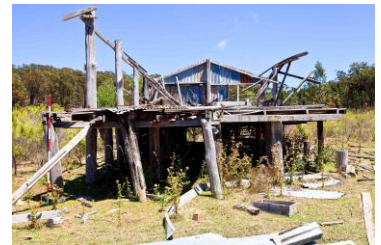
Image 37: Front elevation of the shearing shed. Facing west. File-6806.