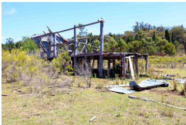
Image 35: Wider view of the shearing shed. Facing northwest. File-6803.