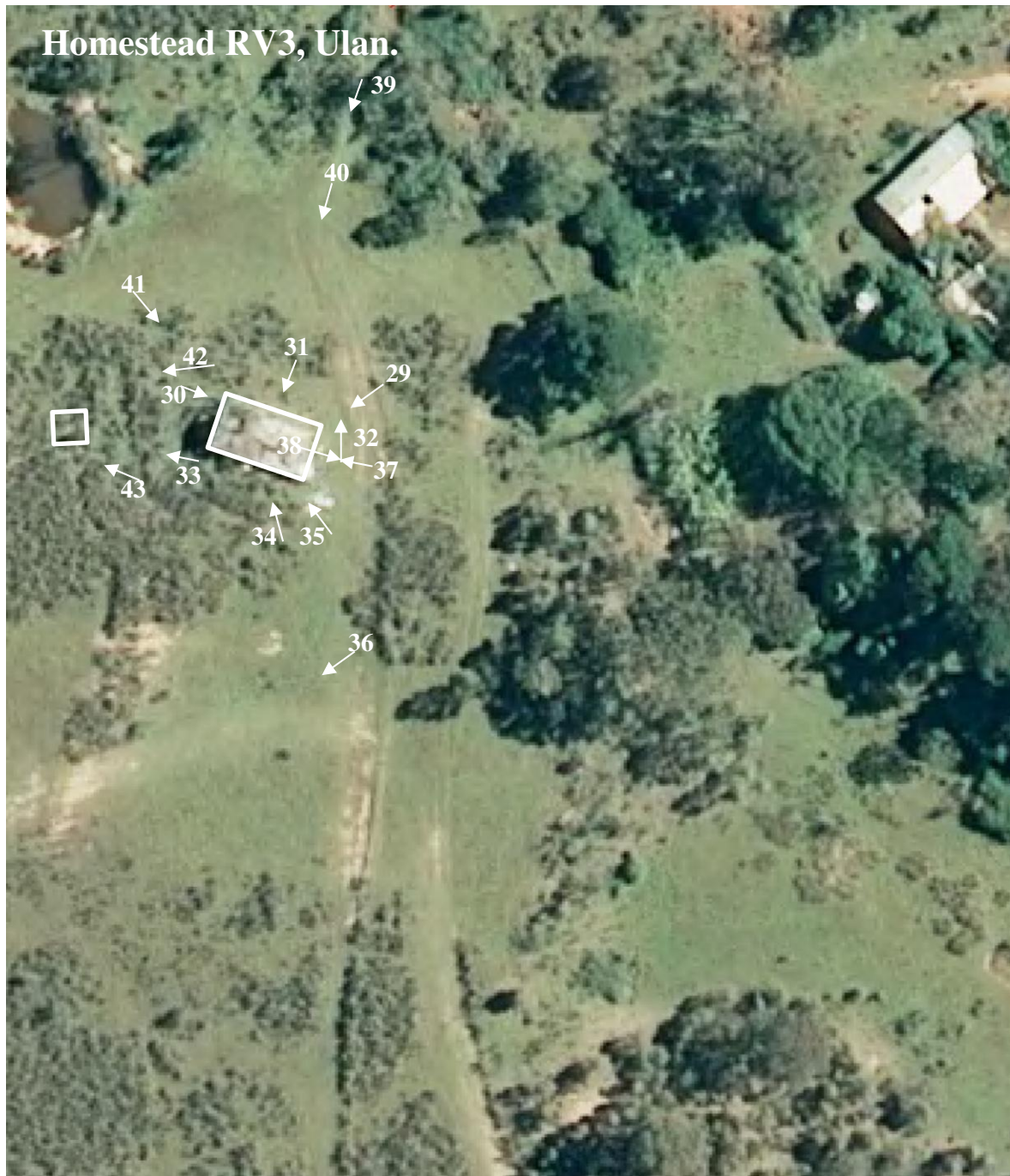
Figure 7.2. Image showing the positions from where photographs were taken of the Homestead RV3.