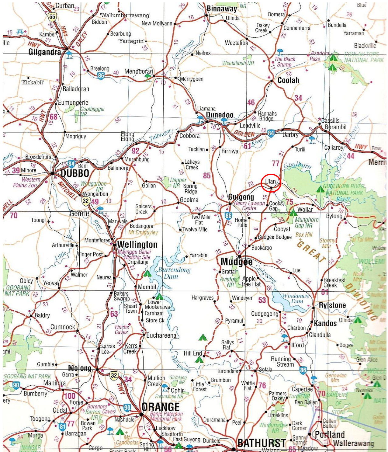
Plan showing the location of Ulan in the mid western region of New South Wales. From: Australia Road and 4WD Atlas . HEMA maps. Seventh edition.