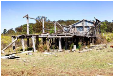
Image 29: Remains of a shearing shed south of the homestead. Facing southwest. File-6784.