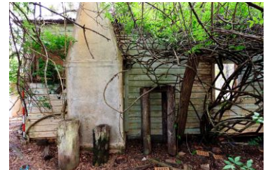
Image 18: Chimney on southwest side of the weatherboard cottage. Facing northeast. File-7036.