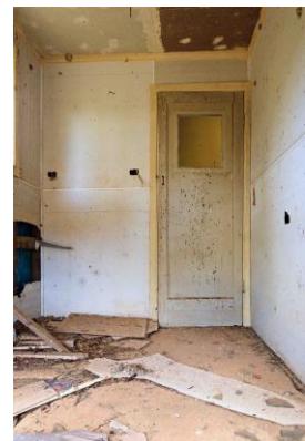
Image 25: Interior of the fibro/Masonite addition (southwest rooms). Facing northeast. File-7044.