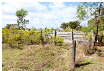
Image 42: View to the yards and loading ramp. Facing west. File-7066.