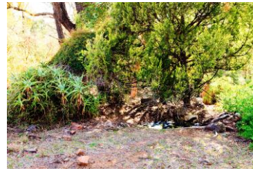
Image 51: Garden to the east with small pond. Facing east. File-7008.