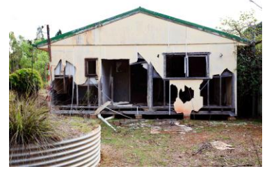
Image 15: Southwest elevation of the fibro / masonite addition. Facing northeast. File-7040.