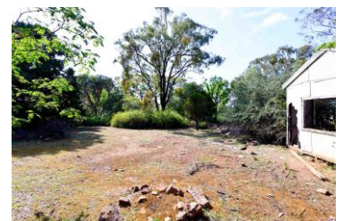
Image 9: View across the turning circle to the east garden. Facing southeast. File-7016.