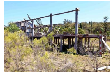
Image 34: Front and side view of the shearing shed. Facing northwest. File-6802.