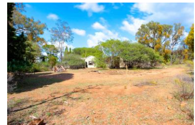
Image 64: View from the main entrance driveway to the homestead. Facing southwest. File-7092.