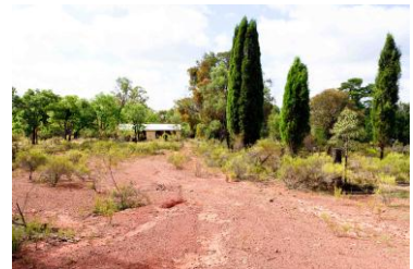
Image 61: View to the homestead from the driveway between a work shed and the house. Facing southeast. File-7060.