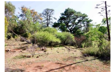
Image 52: The driveway is lined with rocks (centre). Facing northeast. File-7020.