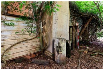
Image 19: Chimney on southwest side of the weatherboard cottage. Facing east. File-7037.