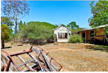
Image 1: Homestead and addition with wagon in the foreground. Facing south-west. File-6826.