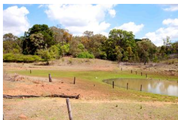
Image 65: General view over a large dam looking back to the homestead. Facing west. File-7128.