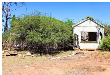
Image 5: North elevation with earlier weatherboard cottage to the left. Facing southwest. File-6820.