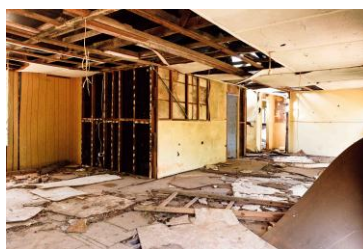
Image 27: Interior of the fibro/Masonite addition (main area). Facing south. File-7047.