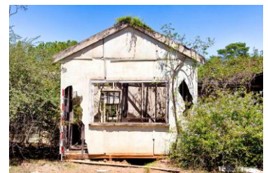
Image 6: North elevation of a fibro addition. Facing southwest. File-6841.