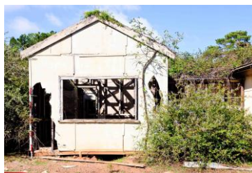
Image 11: North elevation of the fibro cottage addition. Facing southwest. File-7022.