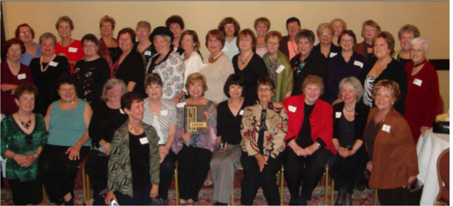
Golden Belle Class of 1960 held a great reunion