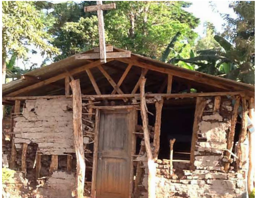
Current Udoro Church structure to be replaced.

One thing that helps us gain perspective is to consider the world in which Jesus was born. God's chosen people, Israel, had been regularly beaten down by a succession of empires. The Assyrians, Babylonians and Persians each had