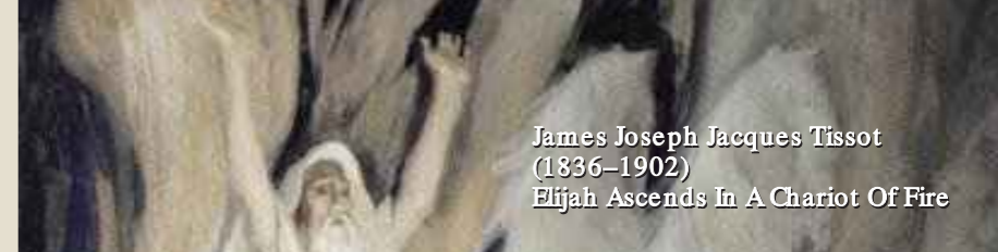
James Joseph Jacques Tissot (1836–1902) Elijah Ascends In A Chariot Of Fire