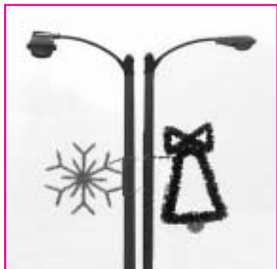
New holiday decorations will be installed on street light standards.

This year's Christmas Tree Lighting ceremony will take place on December 3, beginning at 6 p.m. Preparations for the lighting ceremony begin the end of next month. It takes about four days to put all 1,500 lights on the 60-foot-tall tree in Plaza Park. City maintenance crews will also install more than 50,000 lights throughout the Mission District. The Christmas tree will be lit at 7 p.m. There will be live entertainment and refreshments, and it's rumored that Santa will make an appearance atop a vintage fire truck.