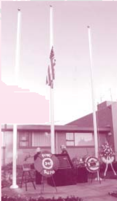
September 11, 2002