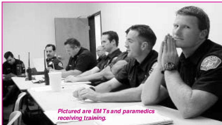
Pictured are EMTs and paramedics receiving training.

Grand Avenue - Anderson to City Limits Delta Street - Valley to Scott Anderson Way - Chestnut to Fairview Scott Street - Charlotte to End Prospect Avenue - Chestnut to Fairview Pine Street - Wells to Chestnut Chestnut Ave. - San Gabriel to Charlotte California Street - Wells to Chestnut Wells Street - San Gabriel to City Limits Lafayette Street - Wells to Chestnut Scott Street - San Gabriel to Charlotte Walnut Street - Wells to Chestnut Gladys Avenue - Scott to Valley Gladys Avenue - Scott to Wells Charlotte Avenue - Wells to Chestnut Charlotte Avenue - Valley to Wells Abilene Street - Charlotte to End