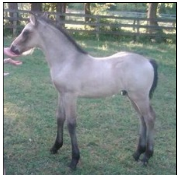
"Blue Ridge Patrick Henry" Moxley Duncan x Hayselden Persephone