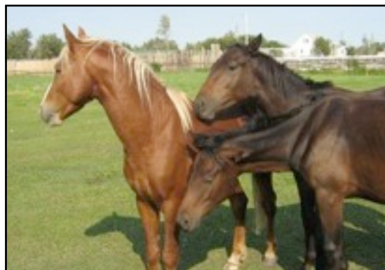
Friends of Drogheda Pyjamas seem to be saying "we're sad, we don't want you to go!" "Pyjamas" ponders "Which way is Manitoba anyway??"

Whoever coined the phrase "Black is Beautiful" was absolutely right!!