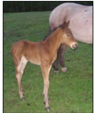
Sugar 'N Spice