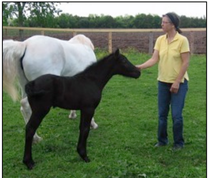
Filly foal by Kippure Cara out of Eastie