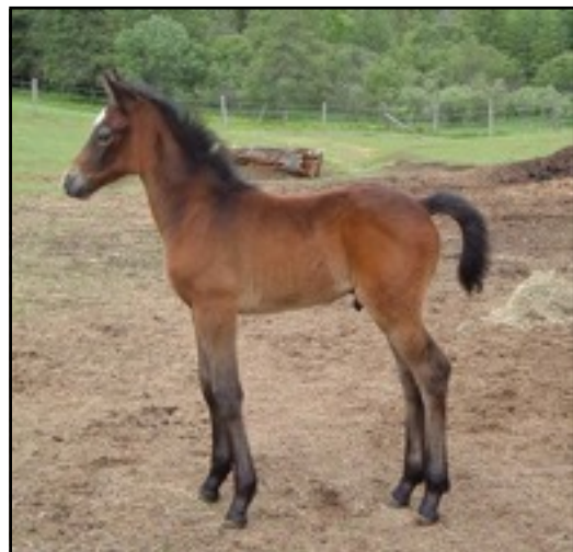
Elphin Malachite (*Caragh Gaoithe x Elphin Milis Rosanna)