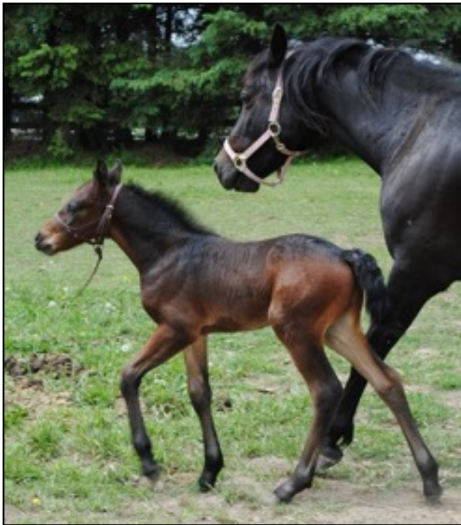
"Beaker" Tibyl x Belfast Button.