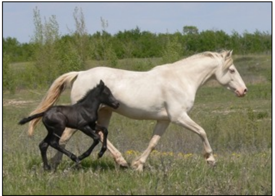
One day old "Elodon Riona" by Century Hills Aedan Zodiac out of Castlebar Gaelic.