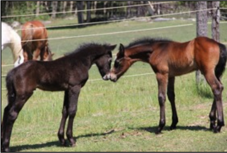
Elphin Tuuli (*Caragh Gaoithe x Elphin Michaelmas Daisy) and Elphin Malachite (*Caragh Gaoithe x Elphin Milis Rosanna)