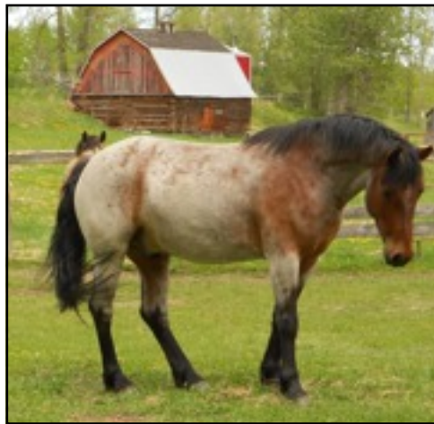
Rills Hot Sauce