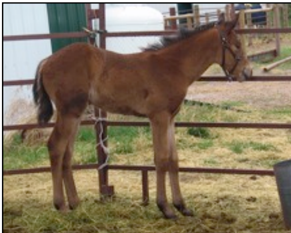
Filly by Bantry Bay's Dillon out of Avenn's Airrin