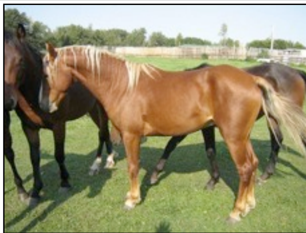
Drogheda Pyjamas "Posing in the Pasture".