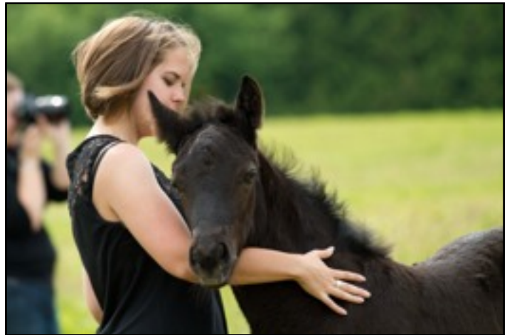
Century Hill's Spring filly Another lovely and outgoing filly out of Eastie by Cara also born May 17th!