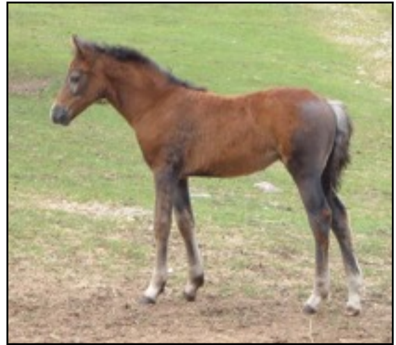
Elphin Kittiwake (Maplehurst Michael MacDaire x *Scottsway Lullaby)