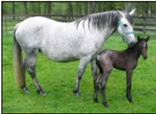
Rills Mariette & new filly