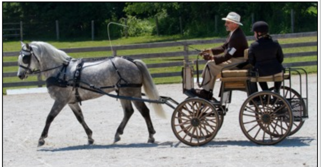
...proceed at M to a working walk...we're almost there...