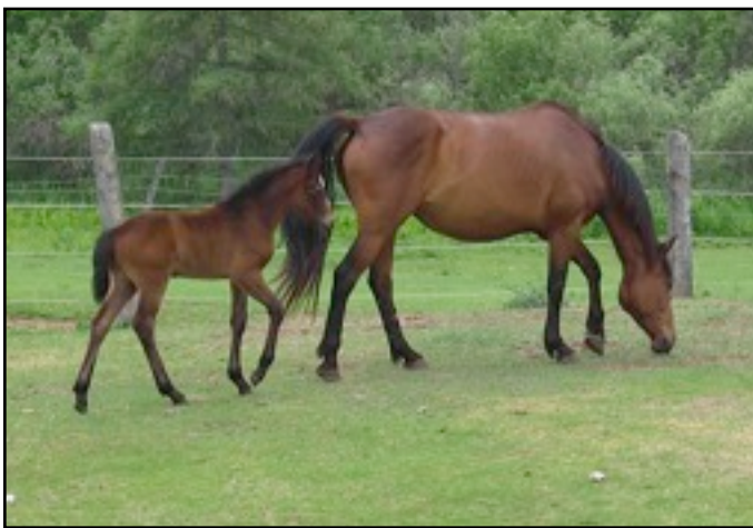
Filly out of Elphin Milis Rosanna by Henkka