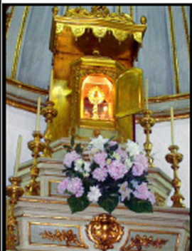
Eucharistic Miracle, Church of St. Stephen, Santarem, Portugal

Drink the water from the miraculous spring and submerge yourself in the healing baths. Candlelight rosary procession in the evenings.