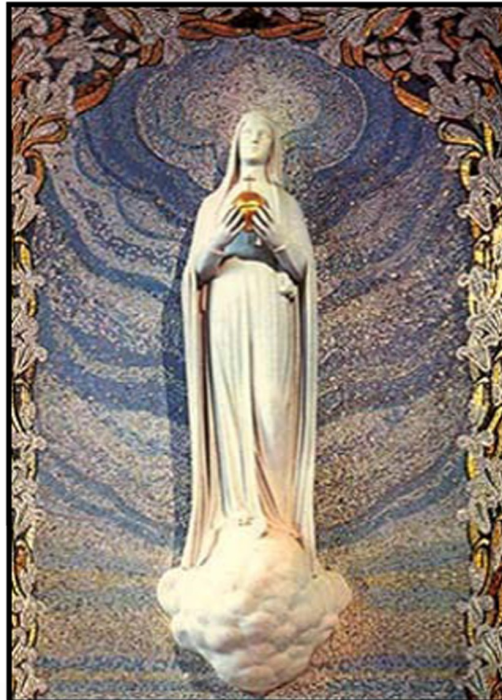
Shrine of Our Lady of the Miraculous Medal Paris, France

Join the candlelight rosary procession at Fatima.