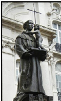
St. Anthony of Padua, St. Anthony Church, Lisbon