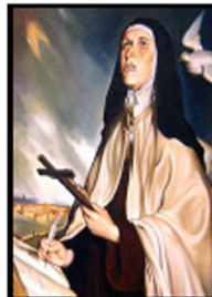
St. Teresa of Avila, Spain