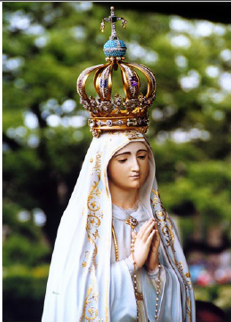
Our Lady of Fatima

$4,899 per person from San Francisco, CA (plus airport taxes)