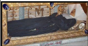
Incorrupt body of St. Catherine Labouré, Shrine of the Miraculous Medal, Paris