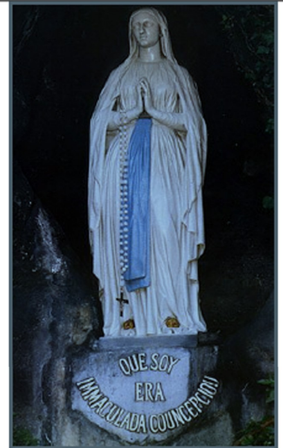
Grotto of Our Lady of Lourdes, France

Drink the water from the miraculous spring and submerge yourself in the healing baths. Candlelight rosary procession in the evenings.