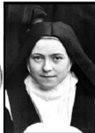
St. Therese of Lisieux, France