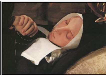
Incorrupt body of St. Bernadette Soubirous, Nevers, France