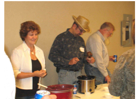
Our Chili makers!