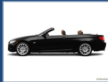
2012 BMW 328i Convertible (2-Year Lease) Provided by: BMW of Morristown