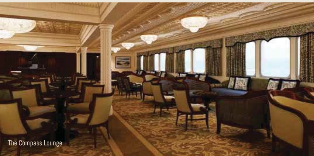
The Compass Lounge