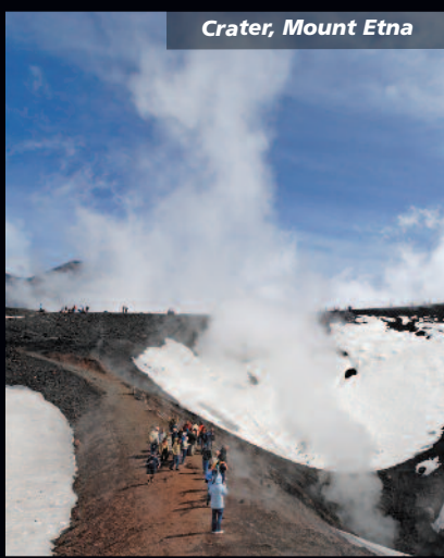
Crater, Mount Etna