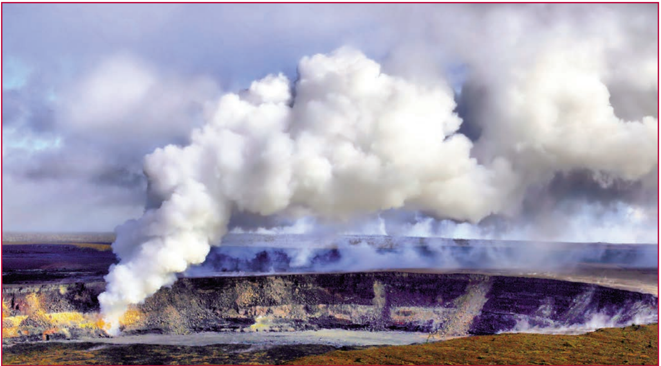
Halema'uma'u Vent, Volcanoes National Park

famous waterfall. Easily accessible, this hike takes less than an hour.