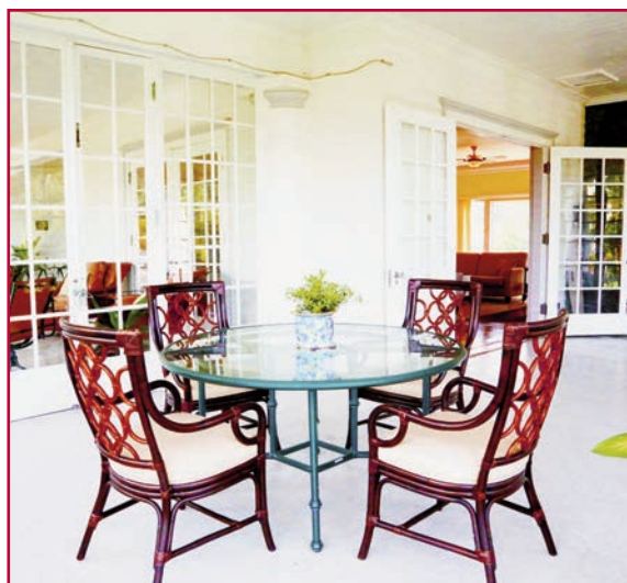
Veranda with desk and art studio area