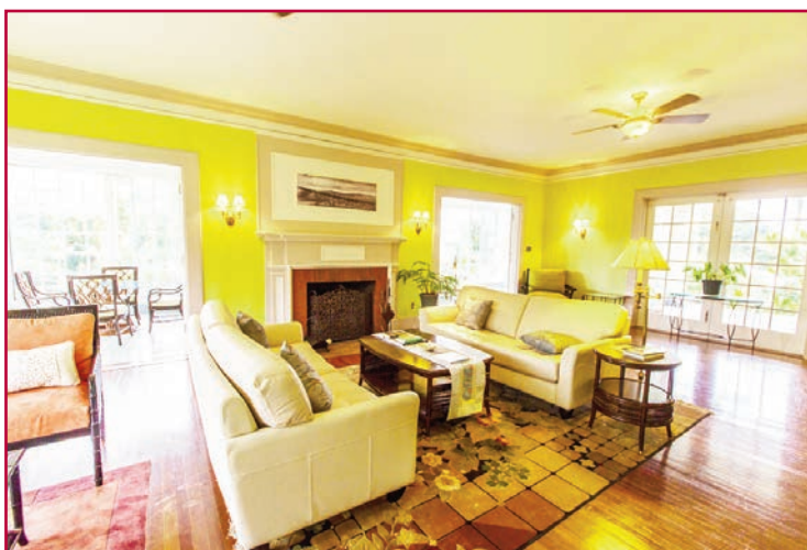
Relax in the light-filled and inviting living room