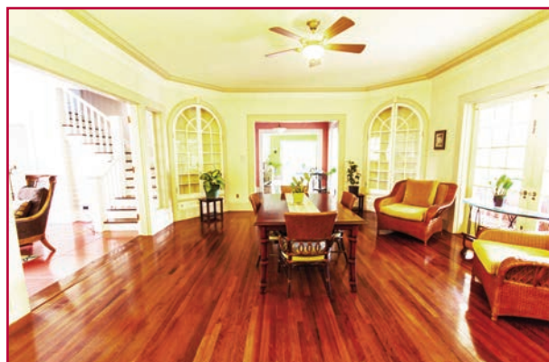
The open and spacious dining room