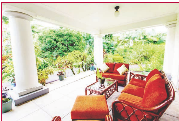
Enjoy the songs of the tropical kingdom outside your front door from the Lanai