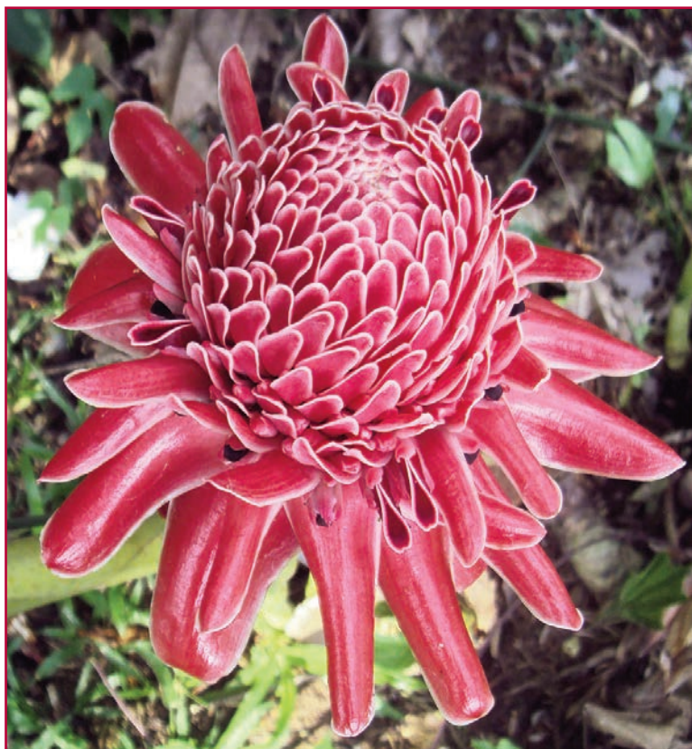
Torch Ginger, Hawaiian Tropical Botanical Gardens