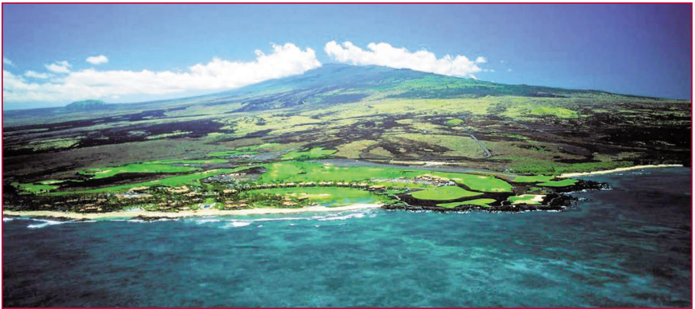
Aerial View of Big Island

Dear University of Chicago Alumni and Friends,