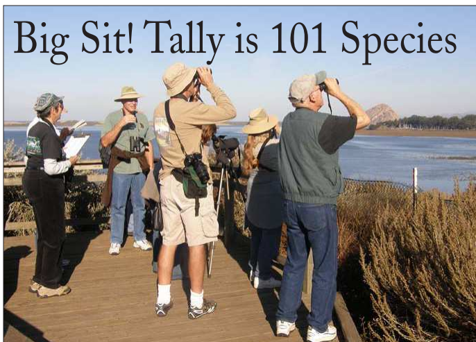
Big Sit! Coordinator Jim Royer (center in shorts) led a pre-Big Sit! walk on the second Saturday of October. The purpose of the walk was to learn what birds might be seen the next day at the Big Sit!. He and walk participants sighted 70 species of birds in about 2-1/2 hours.

Editor's Note: The Elfin Forest Big Sit! circle came in 4th out of 241 counting circles. Cape May, New Jersey, was first with 139 species. A compilation of worldwide Big Sit! results can be found on the Bird Watcher's Digest web site at http://www.birdwatchersdigest.com/bwdsite/connect/bigsit/index.?sc=migration .