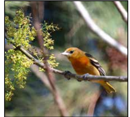
Baltimore Oriole at UCSB