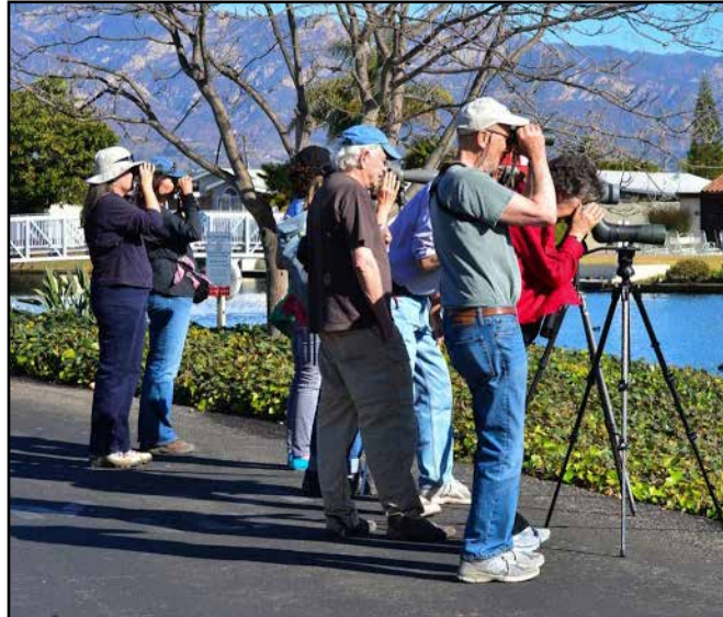
Birders at Rancho Goleta enjoying the Tufted Duck

The tipu effect, as we began calling it, re-energized our scouting and birders all over the county began poking around places normally not birded during count day. City parks, parking lots and residential streets all became birding destinations, and several rarities turned up as a result. Still, birding the normal riparian, coastal, chaparral, foothill and mountain habitats was slow.