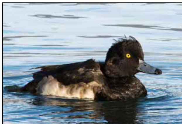
Tufted Duck at Rancho Goleta Mobile Home Park

In the end—and it's not yet over but the count is settling into firm numbers—our CBC tallied 222 species, 2 fewer than our highest count ever, topping the list for California CBCs and ranking 2 nd in the nation. What began as a slow and somewhat dull season has become a near record-breaker. However, the CBC is not all about the species total. At press time, we are still tallying the individual birds and looking at