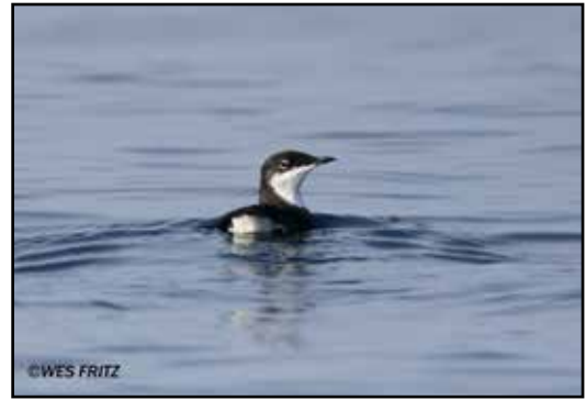
Scripps's Murrelet seen from the boat