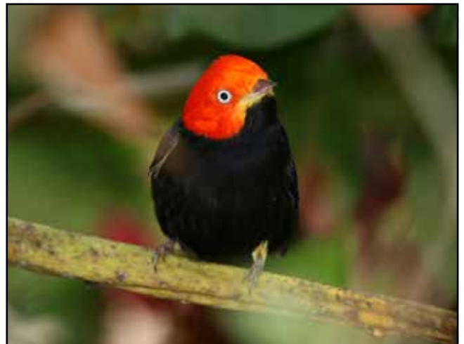
Red-capped Manakin at Chan Chich Lodge, Belize