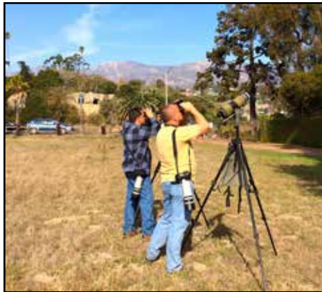
Jamie Chavez and Matt Victoria viewing a Hermit Warbler near East Beach