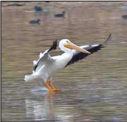
American White Pelican at Laguna Blanca