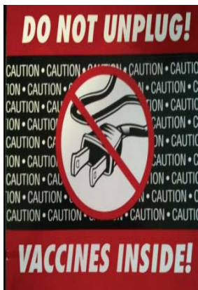
Do Not Unplug Sticker

Place on refrigerator to prevent the refrigerator from accidentally getting unplugged.