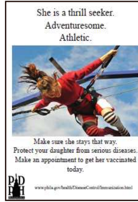
Flyer 3 Bungee Girl (8 1/2 X 11)