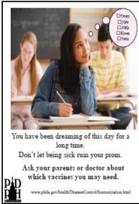
Flyer 1 Daydream girl (8 1/2 X 11)

The Philadelphia Department of Public Health Immunization Program