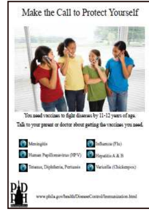
Flyer 4 Cell phone girls (8 1/2 X 11)