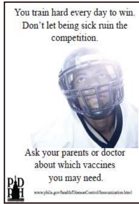
Flyer 2 Football player (8 1/2 X 11)