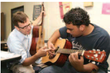
Learn to play the guitar!

Sign up today for any of our four beginning or two advanced class sessions.