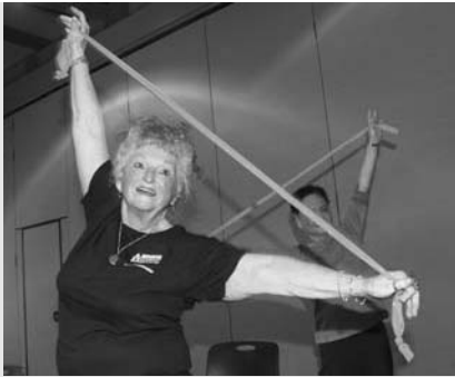
Balance and Mobility Classes for Older Adults.

School of Continuing Education: Cultivating Strength in Our Students.