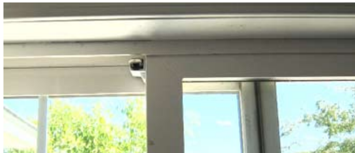
Slider in locked open position, allowing fresh air but no access.