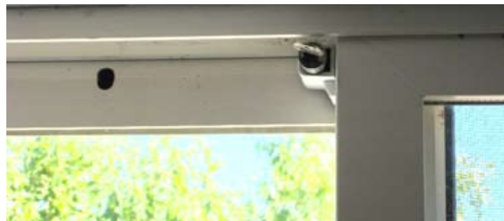
Slider in locked closed position. Note extra hole to the left.

Deputy Sheriff Teresa Aquila's Neighborhood Watch column will return next newsletter.