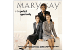
1 Team Building CD