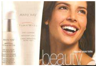
15 Beauty Books