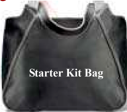
Starter Kit Bag