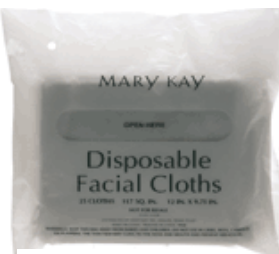
30 Disposable Facial Cloths

*Not pictured: 30 Blank Business Cards 2 Independent Beauty Consultant Agreements