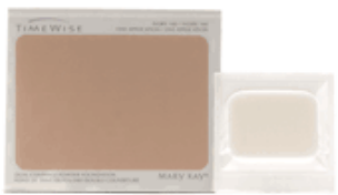
Dual-Coverage Powder Foundation Samples