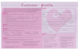
50 Customers Profiles