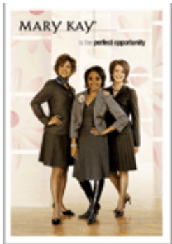
6 Team Building Brochures