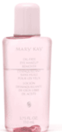
Oil-Free Eye Makeup Remover $14