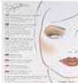
30 Classic Look Cards