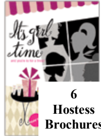
6 Hostess Brochures