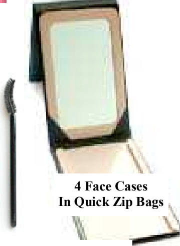
4 Face Cases In Quick Zip Bags