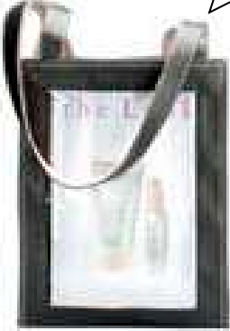
On The Go Tote