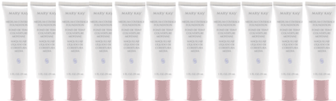
11 Medium Coverage Foundations In our most popular shades! $14 Each—Total $154