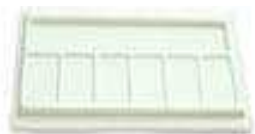
30 Disposable Trays

*Not pictured: Satin Hands Pampering Set samples with instructional insert included in Quick Zip Bag