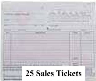
25 Sales Tickets