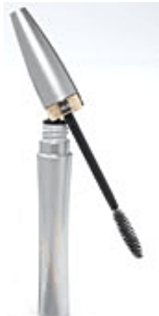
Ultimate Mascara Black $15