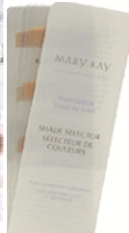
1 Shade Selector Tool