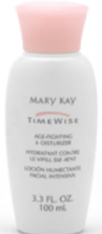
Age-Fighting Moisturizer Normal/Dry $22