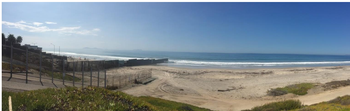
The U.S. side of the U.S.-Mexico border

The details of these activities may change as we learn of more cultural and educational opportunities that allow us to further develop our plans. No additional forms are required for the U.S.-based Wednesday activities at this time. Please email director@sierraserviceproject.org or call the office at (916) 488-6441 if you have further questions.