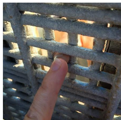
The “pinky kiss” across the border fence at Friendship Park