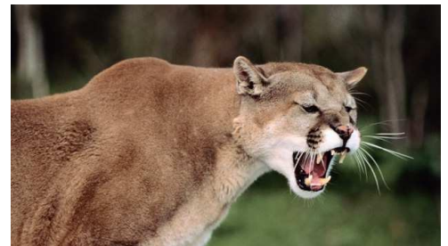
Steering Committee from page 3

Black bears usually avoid people, but if they start to associate people with food they may become aggressive. If the bear continues to visit your property, contact wildlife control officers for assistance.