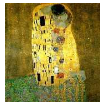
The Kiss, a painting by Klimt, Gustav