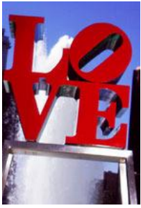
LOVE sculpture in LOVE Park (JFK Plaza), a plaza located in Center City, Philadelphia, Pennsylvania