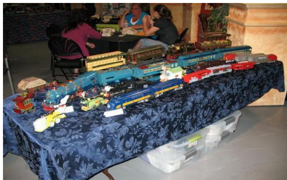
LOTS of old trains! See the prototype of the new METCA