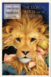
The Lion, the Witch and the Wardrobe