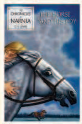
The Horse and His Boy