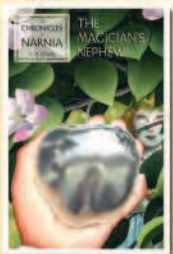
The Magician's Nephew

Enter the World of Narnia with these riveting paperback editions from HarperCollins Children's Books!