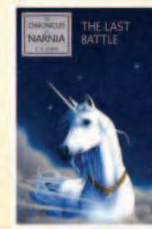
The Last Battle