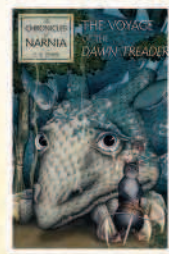
The Voyage of the Dawn Treader