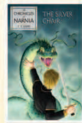
The Silver Chair